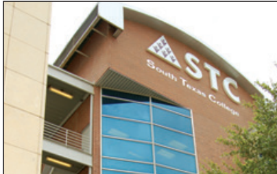
Nursing and Allied Health Campus